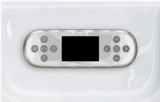
Digital Topside Control