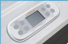
Digital Topside Control