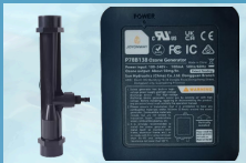
Corona Discharge Ozone